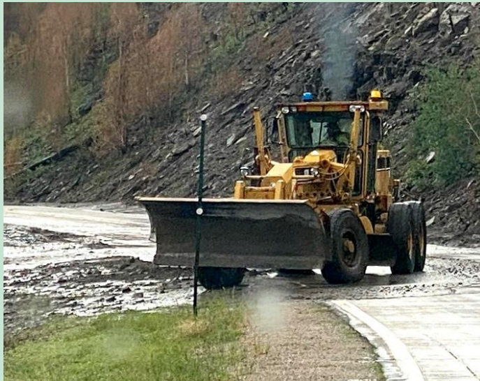
The Colorado Department of Transportation cleared mud from Highway 125 after a mudslide on July 5.

For more information about flood threats, mudslides and forecasts, visit www.northernwater.org/GCWatershedRecovery/mudslides . Also please sign up for CodeRED alerts at www.gcemergency.com .