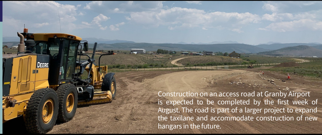
Construction on an access road at Granby Airport is expected to be completed by the first week of August. The road is part of a larger project to expand the taxilane and accommodate construction of new hangars in the future.

News & Updates from Grand County's Board of County Commissioners