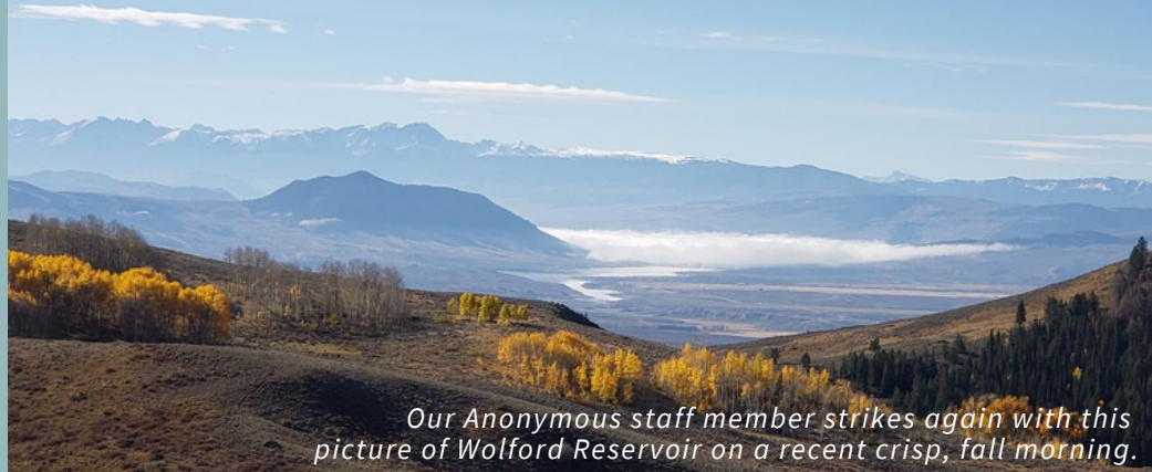
Our Anonymous staff member strikes again with this picture of Wolford Reservoir on a recent crisp, fall morning.

News & Updates from Grand County's Board of County Commissioners