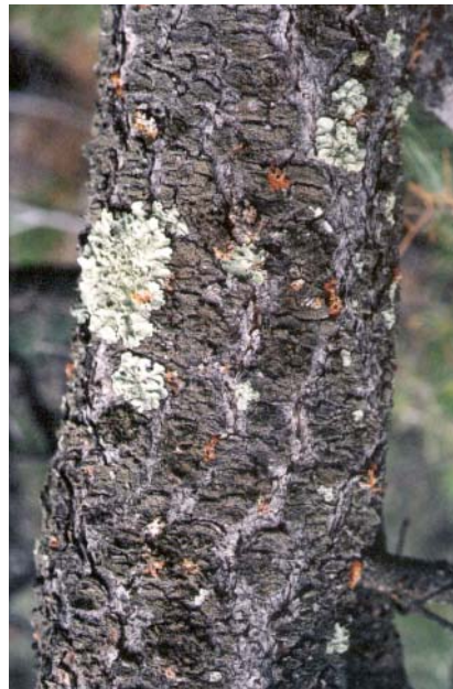
Ips confusus pitch tubes on infested piñon pine trunk.

No chemical treatment exists for trees or wood already infested by ips beetles. In rare cases where it is feasible to reduce the threat to live trees by killing beetles within infested trees before they exit, treatments involve bark removal, chipping the wood into small pieces, covering piles with a double-layer of 6-mil thick clear plastic sealed around the edges with soil to heat (solarize) the wood, or physical removal of infested material from the site to an area a mile or more from susceptible trees.