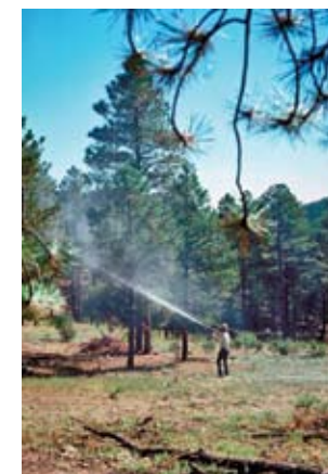
Figure 10: Large, uninfested pine being preventively sprayed. This protects high-value trees and should be done annually between April 1 and July 1.