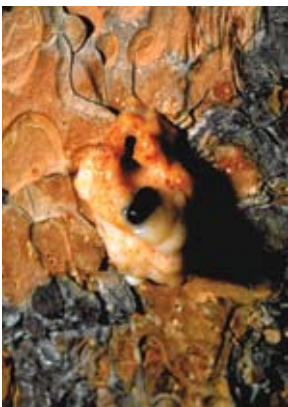
Figure 6: Not all pitch tubes indicate successful attacks. Note the beetle trapped in this large pitch tube. If the majority of tubes look like this, the tree may have survived the current year's attack.