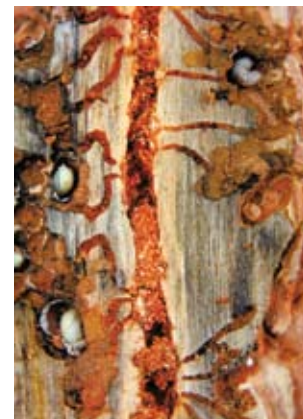
Figure 8: Characteristic tunnels (galleries) of mountain pine beetle made by the adults and larvae. The underbark area looks like this in late spring. Bluestained wood is caused by fungi the beetles introduce.

An important method of prevention involves forest management. In general, MPB prefers forests that are old and dense. Managing the forest by