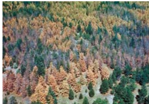
Figure 4: Mountain area infested by MPB, showing three years of mortality. Old, dead trees are gray; newly killed trees are straw yellow or orange. Some trees may also be infested but do not turn color until nine months or so under attack.

MPB larvae spend the winter under the bark. Larvae are able to survive the winter by metabolizing an alcohol called glycerol that acts as an antifreeze. They continue to feed in the spring and transform into pupae in June and July. Emergence of new adults can begin in mid-June and continue through September. However, the great majority of beetles exit trees