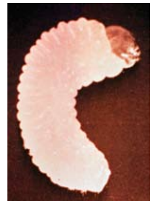
Figure 5: Larva of MPB (actual size, 1/8 to 1/4 inch). They are found under the bark in tunnels.