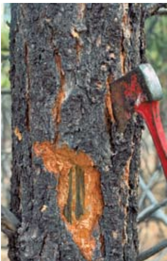
Figure 7: Checking beneath the bark for MPB. This attack was successful (note tunnels and stain).