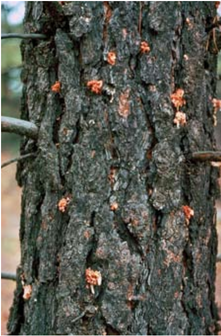
Figure 2: "Pitch tubes" indicating trunk attacks by MPB. Success of the attacks is confirmed by looking under the bark with a hatchet for beetles, their tunnels and/or bluestaining.