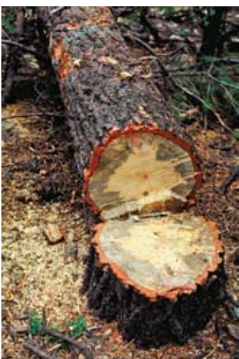
Figure 9: Cut tree killed by MPB, showing the characteristic blue-staining pattern.