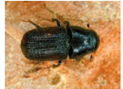
Figure 3: Top view of adult MPB (actual size, 1/8 to 1/3 inch).

Mountain pine beetle has a one-year life cycle in Colorado. In late summer, adults leave the dead, yellow- to red-needled trees in which they developed. In general, females seek out large diameter, living, green trees that they attack by tunneling under the bark. However, under epidemic or outbreak conditions, small diameter trees may also be infested. Coordinated mass attacks by many beetles are common. If successful, each beetle pair mates, forms a vertical tunnel (egg gallery) under the bark and produces about 75 eggs. Following egg hatch, larvae (grubs) tunnel away from the egg gallery, producing a characteristic feeding pattern.