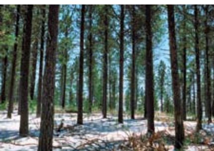
Figure 11: The appearance of a forest thinned to help prevent MPB. This can also improve mountain views and reduce fire hazard.

pine beetle, leading to early reports that “MPB is flying.” Be sure to properly identify the beetles you find associated with your trees.