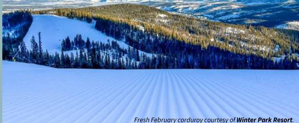
Fresh February corduroy.

News & Updates from Grand County's Board of County Commissioners